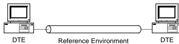
Figure 1: Both the DUT and link partner are DTEs.

Connect the DUT to its link partner through the reference environment as shown in figure 1. The reference environment is a channel appropriate